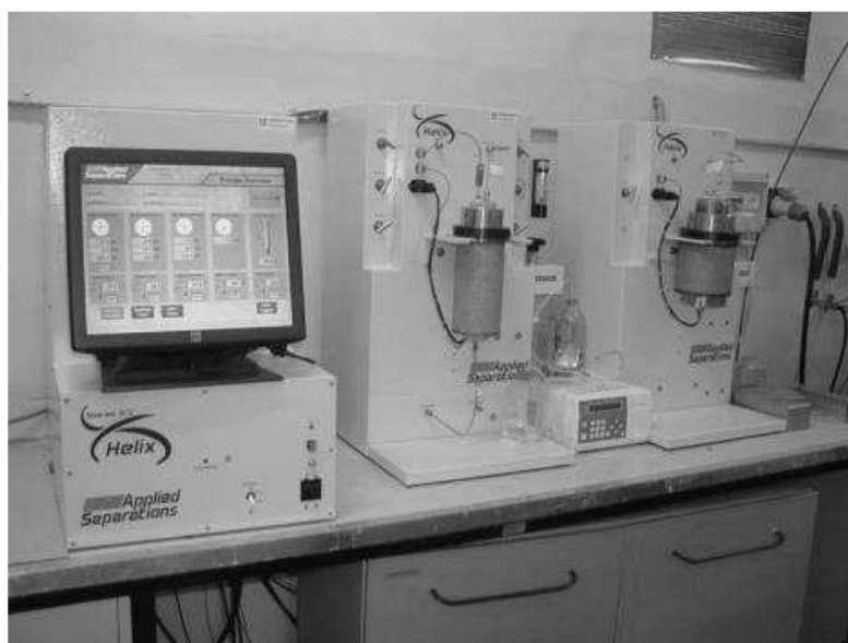
Figure 2 - Innovative technologies used in the astaxanthin extraction from shrimp waste ( P. longirostris ): SFE (Supercritical Fluid Extraction) plant.