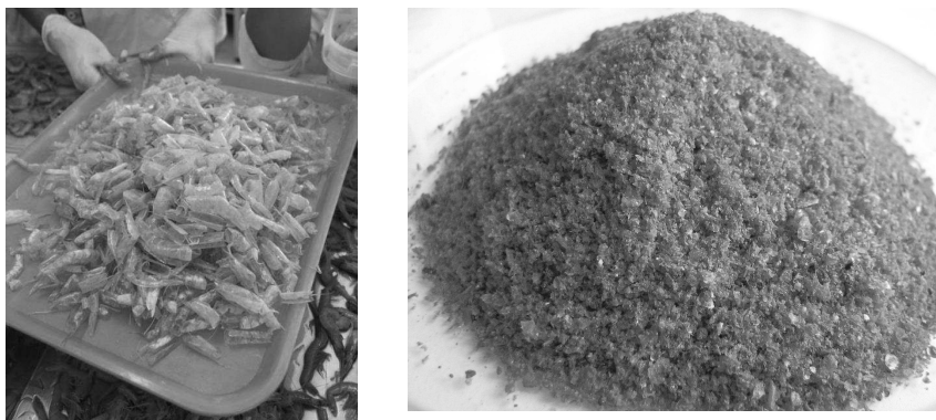
Figure 1 - Steps of processing shrimp waste.

nm, utilizing the equation shown by Simpson & Haard (1985).